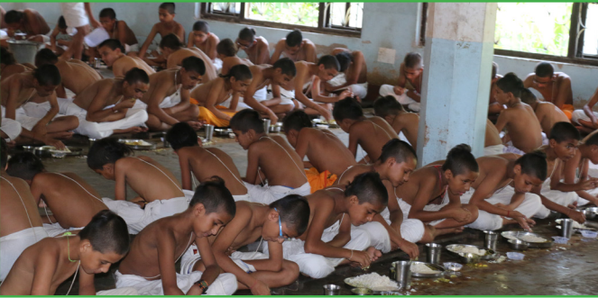
The Ashram receives donations in the form of

Gurukul and Ashram operates from the donation given by well-wisher devotees to the founder saint and other financial assistance received in the Ashram. The institution maintains an up to date audited records of its income and expenditure thereby submit the same to the concerned department.